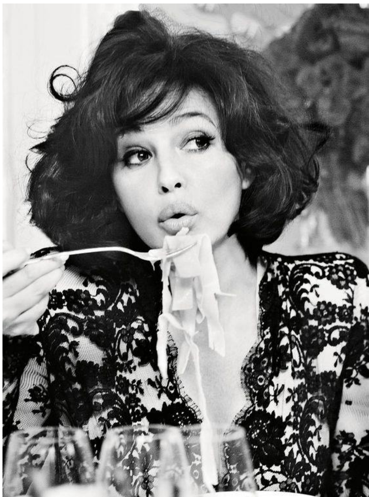
Monica Bellucci, Italian actress